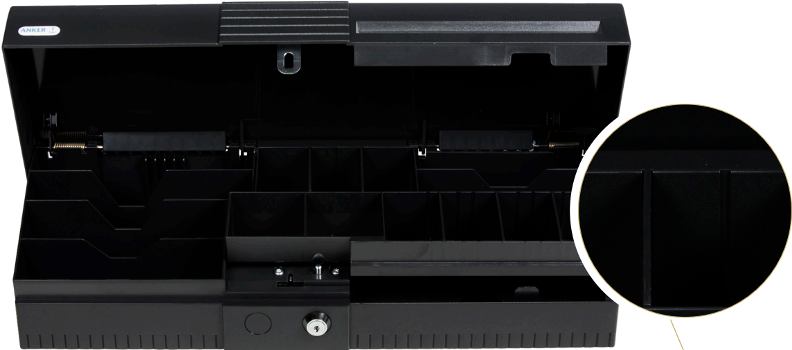
Cassette with 9 coin compartments