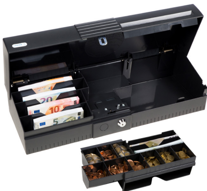
Customised configuration with coin compartments