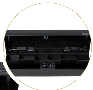
Ergonomic inner partitioning – coin compartments with a sloped front