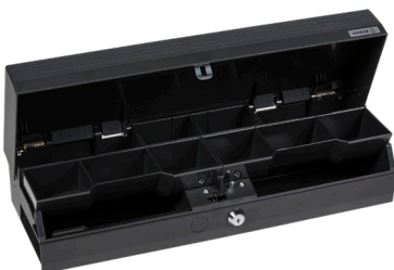
Unfitted cassette with lock