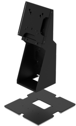
Stand + base (countertop version)