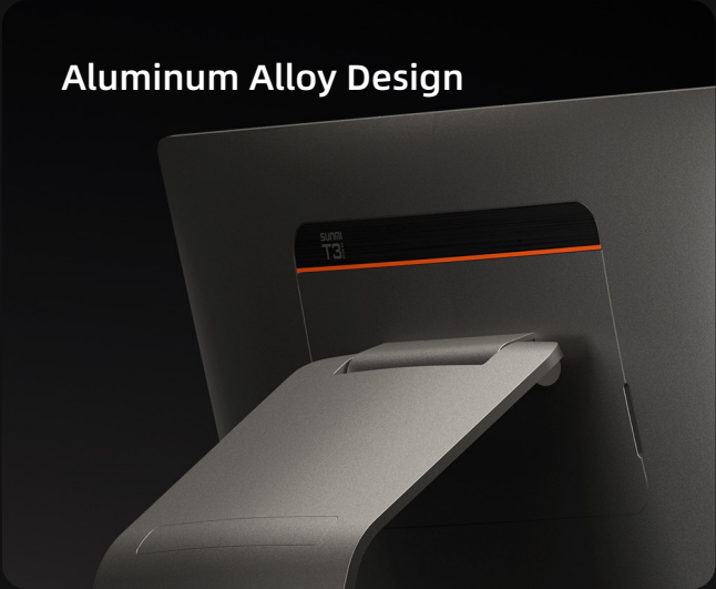
Aluminum Alloy Design